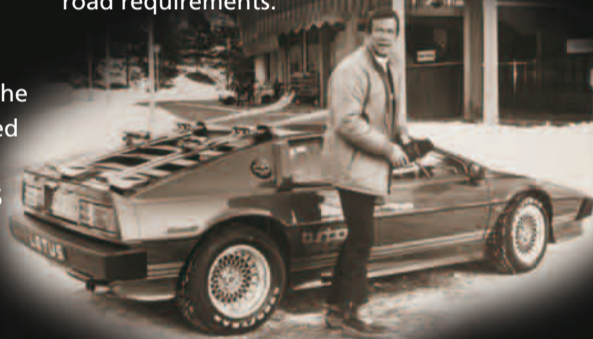
Roger Moore as James Bond in the 1981 film 'For your eyes only' with his Lotus Esprit Turbo. Compomotive CX500 3 piece wheels.

in the best technology, backed by unmatched design and production know-how, still a family company and unrivalled at producing specialist bespoke performance wheels for competition and road requirements.