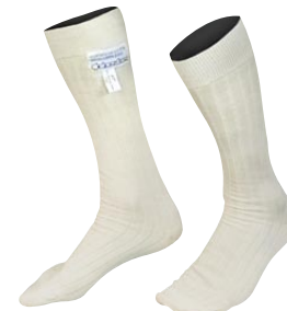
470 405 20 white

FIA 8856-2000 Approved. - Seamless construction. - Knee length