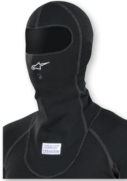
475 439 11 anthracite

Complies with FIA8856-2000 homologation standard. - Double layered face area for extra protection. - Flat seams designed to reduce pressure points and improve strength. - Fabric stretches for a close and comfortable fit. - Mouth opening for drink tube access.