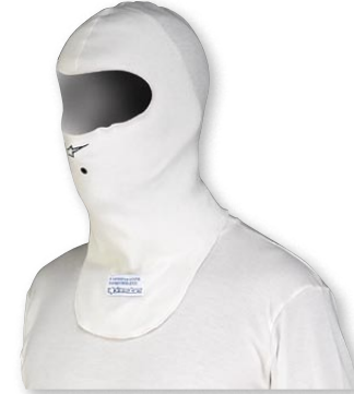
475 435 20 white

FIA 8856-2000 Approved. - 180gr 100% Meta Aramide. - Double layer front for improved protection. - Flat seam construction to reduce pressure points and improve strength. - Open Face.