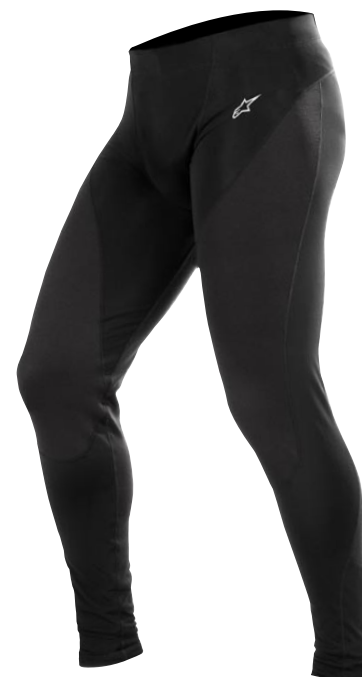
TOP: 475 348 10 black BOTTOM: 475 358 10 black