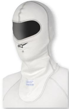
475 439 20 white