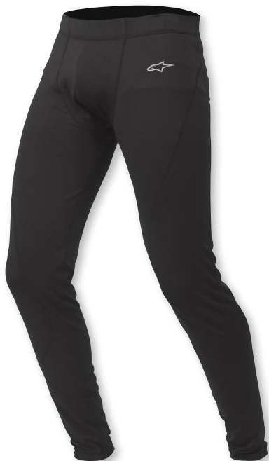
TOP: 475 349 10 black BOTTOM: 475 359 10 black