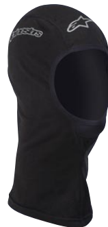
475 817 10 black

Heavyweight and moisture wicking material that can be used for any season. - Open face design with ergonomic fit. - Flat lock seams for comfort feel. - Strategic chin panel design for better fit, feel and comfort. - Extended neck length for added protection. - Reflective printed Astar logo.